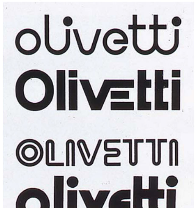
Olivetti Graphic Design / Design by Walter Ballmer, Milan, Italy 1960.

Discretionary ligatures li , tt , ti , and tti , based on a discarded version of the logo designed by Walter Ballmer for Olivetti in 1960.